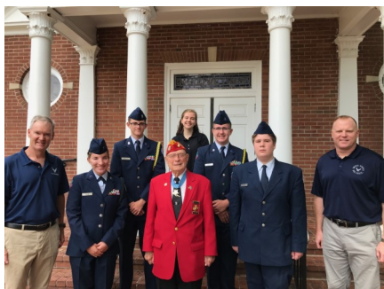
PA-771 & Medal of Honor Recipient "Woody" Williams

When the work was done, there was still plenty of room left for fun. While our trips to Washington D.C. and McGuire AFB, NJ were great, they weren't the only trips this summer. During the summer, we picnicked at Valley Forge National Park, went to the "Turkey Hill Experience", toured the Dover AFB museum, visited Centralia, PA, visited the Philadelphia Art Museum, and finally after five summers of trying we made it to Hershey Park! We would challenge any of our students to prove they had a more fun, rewarding, and even educational summer than we had here at PA-771. While the summer might be over, our contributions to the community and opportunities to experience new and exciting things have only just begun. As a matter of fact, we might just be flying on a KC-10 air refueling mission in the next couple weeks.