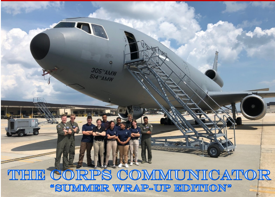
THE CORPS COMMUNICATOR "SUMMER WRAP-UP EDITION"