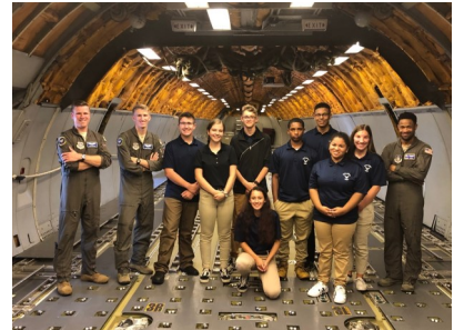
Cadets tour a KC-10 Extender Aircraft