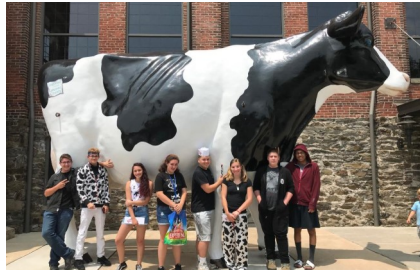
Cadets enjoying the "Turkey Hill Experience"

the public, but also for recipients who were coming to the Grove. We also worked with the Chester County Food Bank at one of their community gardens and at the Coatesville Senior Center, where we assisted in serving lunches to the visitors.