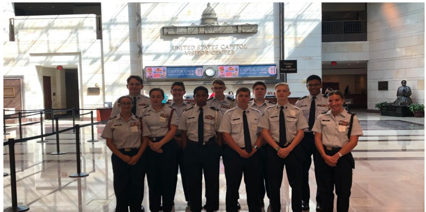
Cadets visit the US Capital Building

After the tour the cadets walked through another tunnel that connected the US Capital to the Library of Congress building before heading back to the bus for the ride home to Coatesville. Overall they had a great learning experience and a fun way to spend one of their last summer days.